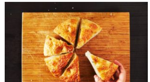
The Grid: Toronto's best breadmakers